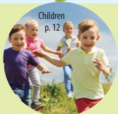
Children p. 12