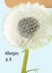
Allergies p. 8

Natural Eye Care for Every Member of the Family