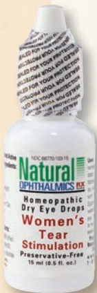
Women's Tear Stimulation Dry Eye Drops