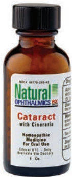
Cataract Eye Drops and Pellets with Cineraria and Eyebright