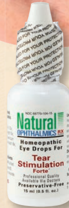
Tear Stimulation Forte Dry Eye Drops

“Dry eye is a main reason why some people stop wearing contact lenses. There are so many causes for dry eye, and there can be different issues with the three separate layers of the tear film. Many patients don’t realize that they have dry eye until they have started on a dry eye regimen and feel the relief. For many patients, I’ll recommend Natural Ophthalmics homeopathic line of dry eye drops. I personally use the Ortho-K Thin [day-time] Drops, which I think are the greatest drops for contact lens wearers.”