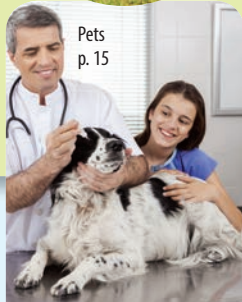
Pets p. 15