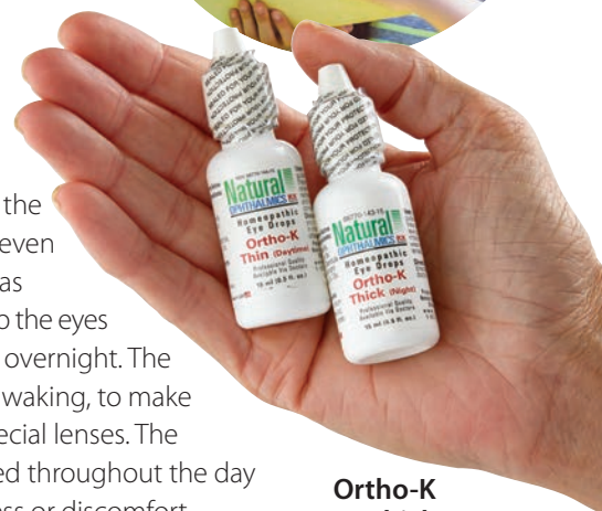
Ortho-K Thick and Thin Drops